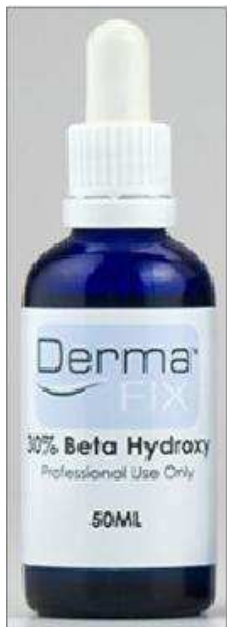
30% Beta Hydroxy Salicylic Acid: 50ml- R360.00

A cosmetic is a product intended to be "rubbed, poured, sprinkled, or sprayed on, introduced into, or otherwise applied to the human body or any part thereof for cleansing, beautifying, promoting attractiveness, or altering the appearance" of the skin. For the most part, products in these categories are mutually exclusive. In dermatology a group of products have evolved that have characteristics of both cosmetics and cosmeceuticals. First called "cosmeceuticals" by Albert Kligman, MD, 2 decades ago, these topical products contain biologically active ingredients, but are sold to improve appearance, not for therapeutic purposes. American dermatologist Albert Kligman is generally accredited with inventing the term cosmeceuticals in the late 1970's as something that does more than colour the skin and less than a therapeutic drug. Some drug products and many cosmeceuticals are marketed as agents that attenuate the effects of ageing skin. To understand cosmeceutical delivery one must have a thorough understanding of skin physiology. The skin is a complex organ, and, as such must be gently persuaded to allow beneficial substances to be absorbed beyond the epidermis, e.g: stimulate the fibroblast production of collagen and elastin,